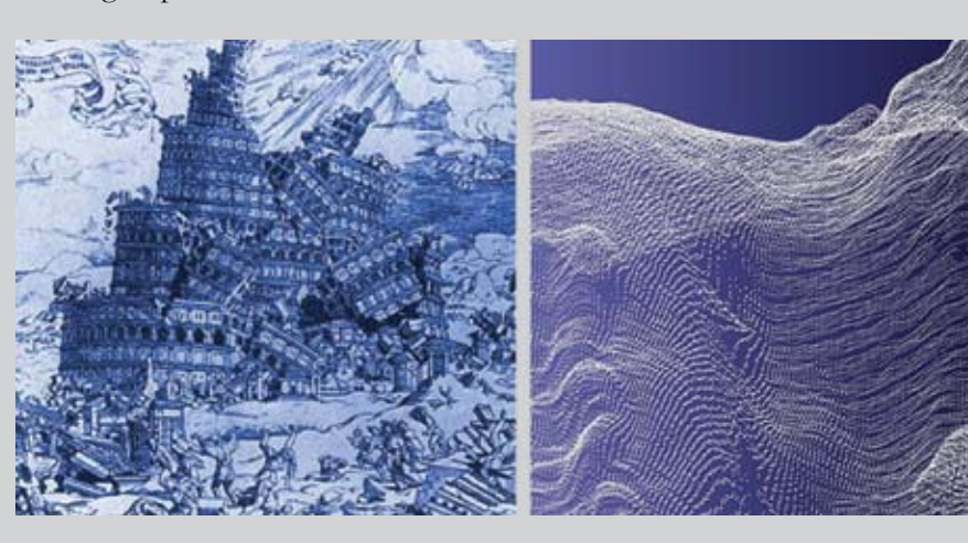
Napoli, Italy | Palazzo Zapata | Piazza Trieste e Trento, 48 | October 10th to 12th 2014

The proposals will be evaluated by the EATGA international staff. The accepted proposals will be circulated via email to the participants before the Workshop and published in the official proceedings. These will contribute to the cloud of ideas and preliminary brainstorming to facilitate the imagination and the work of the groups.